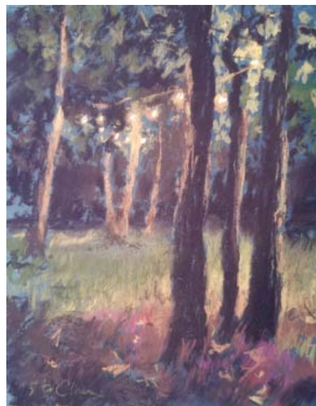
Postoak Night Lights – 1st place nocturn Plein Air Tulsa