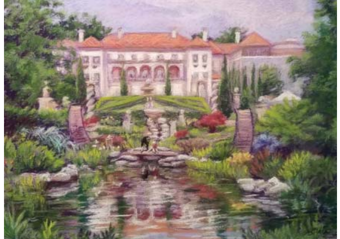
Out back at Philbrook Museum – en plein air