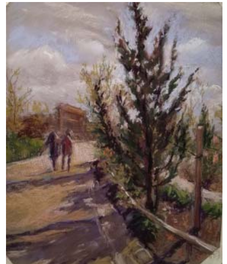
A Walk in the Park Tulsa Gathering Place