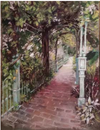
Victorian Garden at Gilcrease en plein air