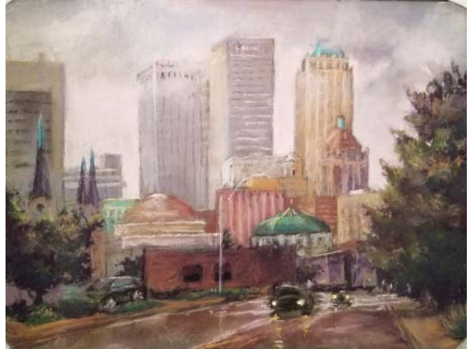
T-Town in the rain – en plein air

I worked several years as an art director and fashion illustrator for various Tulsa companies. I was awarded an Addy for my design work on Profiles in American Art, a series on PBS. I put my career on hold for many years to raise my family. I kept in touch with my art by becoming an art teacher for 17 years at the local high school. Now I am pursuing my art full time. I have studied under numerous nationally renowned artists in workshops and my paintings and commissioned pieces are in extensive private collections.