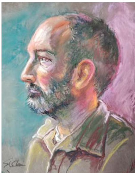
Life drawing of Jory (2 hr)